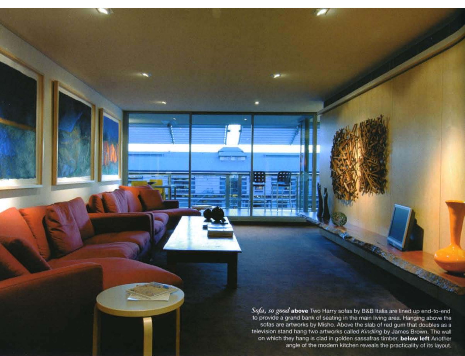
Sofa, so good above Two Harry sofas by B&B Italia are lined up end-to-end to provide a grand bank of seating in the main living area. Hanging above the sofas are artworks by Misho. Above the slab of red gum that doubles as a television stand hang two artworks called Kindling by James Brown. The wall on which they hang is clad in golden sassafras timber. below left Another angle of the modern kitchen reveals the practicality of its layout.