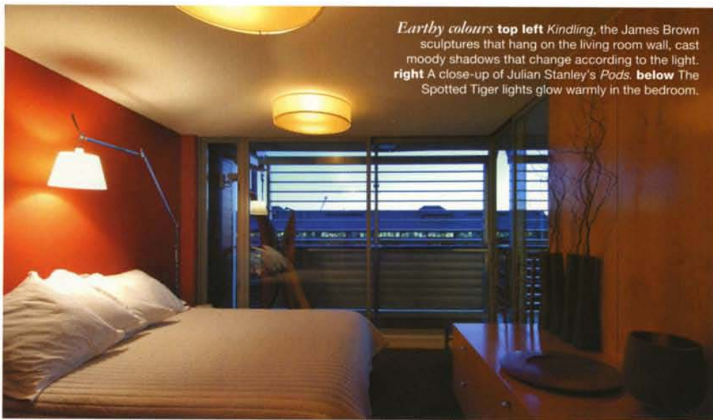
Earthy colours top left Kindling, the James Brown sculptures that hang on the living room wall, cast moody shadows that change according to the light. right A close-up of Julian Stanley's Pods. below The Spotted Tiger lights glow warmly in the bedroom.

Behind the coffee table (once an old school lab table before its legs were shortened), two B&B Italia Harry sofas in red provide a long row of seating. Above the lounges are three artworks Misho painted, predominately in vivid blues, of Coalcliff north of Wollongong in NSW. A fourth painting from the same series, depicting the rising sun, sits above the Superellipse table for Fritz Hansen in the small breakfast area off the kitchen.