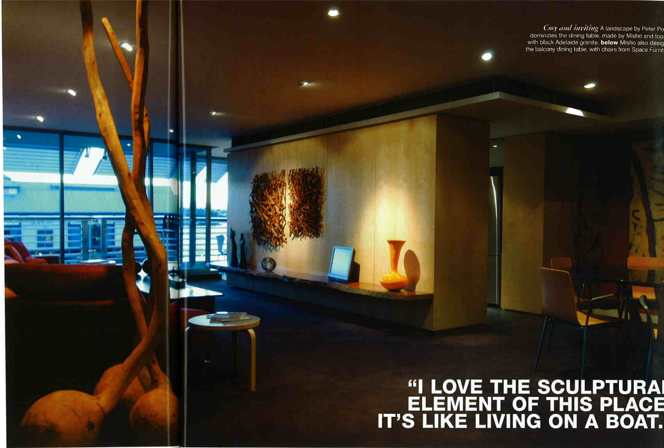
Cosy and inviting A landscape by Peter Poulet dominates the dining table, made by Misho and topped with black Adelaide granite. below Misho also designed the balcony dining table, with chairs from Space Furniture.

"I LOVE THE SCULPTURAL ELEMENT OF THIS PLACE. IT'S LIKE LIVING ON A BOAT."