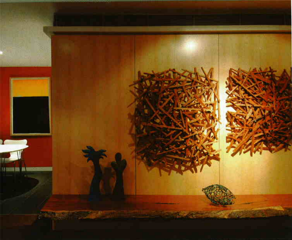
Earthy colours top left Kindling , the James Brown sculptures that hang on the living room wall, cast moody shadows that change according to the light. right A close-up of Julian Stanley's Pods . below The Spotted Tiger lights glow warmly in the bedroom.