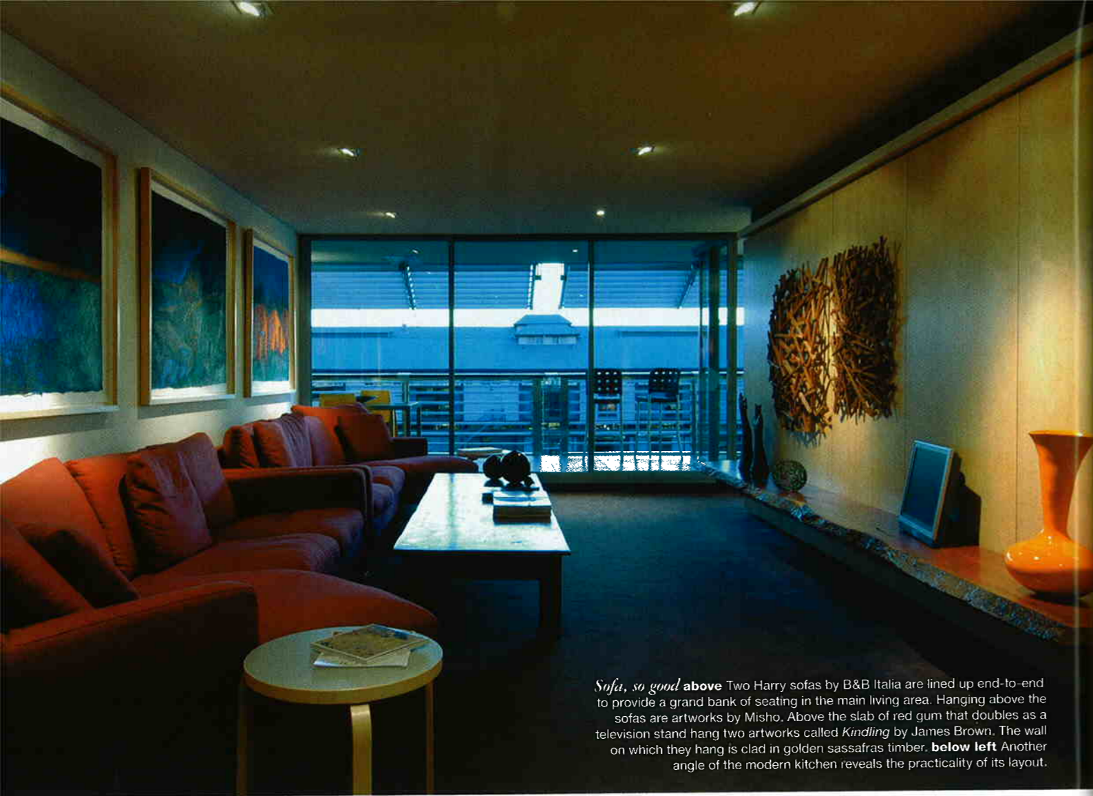
Sofa, so good above Two Harry sofas by B&B Italia are lined up end-to-end to provide a grand bank of seating in the main living area. Hanging above the sofas are artworks by Misho. Above the slab of red gum that doubles as a television stand hang two artworks called Kindling by James Brown. The wall on which they hang is clad in golden sassafras timber. below left Another angle of the modern kitchen reveals the practicality of its layout.